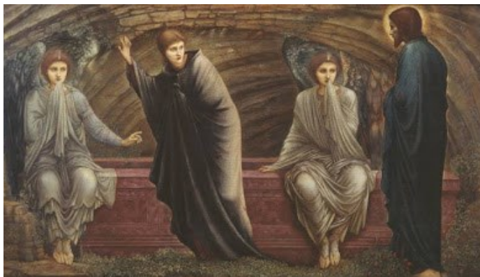
Sir Edward Coley Burne-Jones The Morning of the Resurrection (1886)